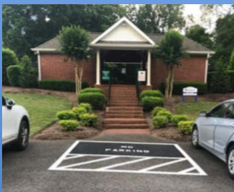
'No Parking' in front of pool entrance

A big Thank You to Girl Scouts Troop #1127! The team did an outstanding job making upgrades to our pool area. The girls put in a lot of hard work including meeting with local police and city officials to discuss materials and project execution. A job well done!