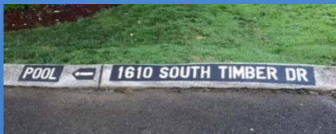
Painted curb address